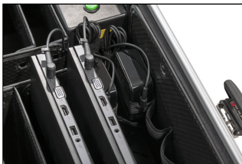
- 10x storage compartment for laptops up to 15,6"