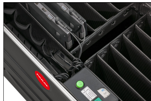
- Charge (Switch On/Off)